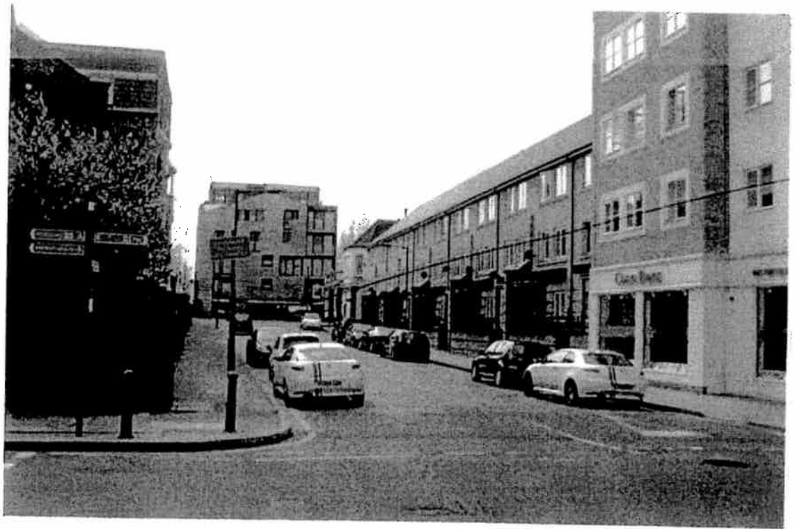
FERRY STREET - SIGNAGE & FOOTPATHS TO THAMES WALKWAY. ZEBRA CROSSING CROSS WESTFERRY RD